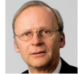
Fabian von Schlabrendorff